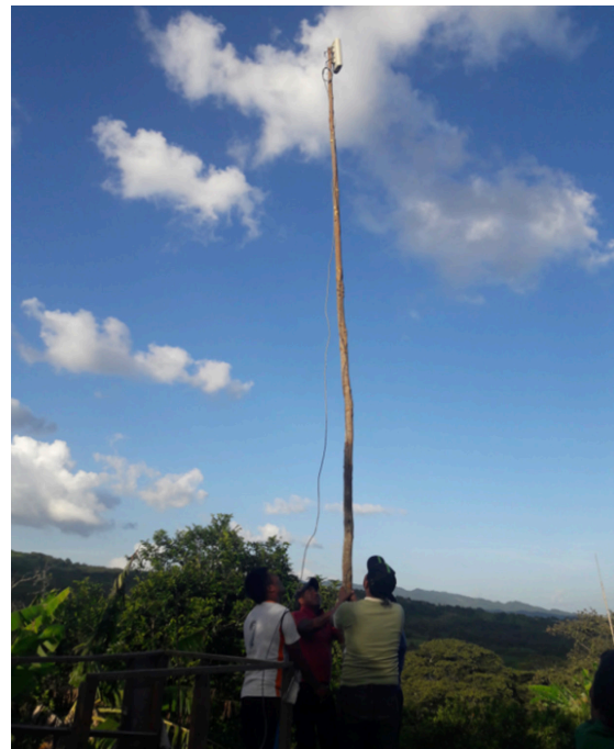
Figures 3 and 4. Bringing internet to the community of San Martín for the first time